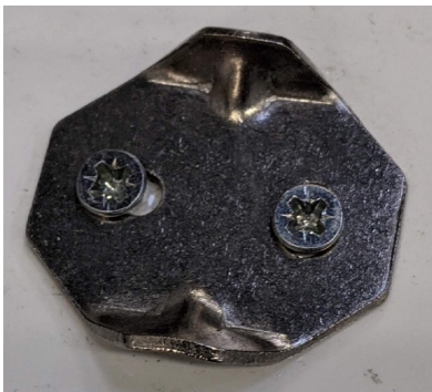
Wall Mounted Fixing Plate - SP19823