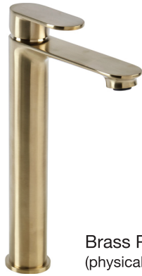
Brass PVD (physical vapour deposition)

FLOW RATE DATA IS TESTED UNDER LABORATORY CONDITIONS: ACTUAL FLOW RATE MAY VARY DEPENDING ON DOMESTIC SUPPLY AND ACCESSORIES