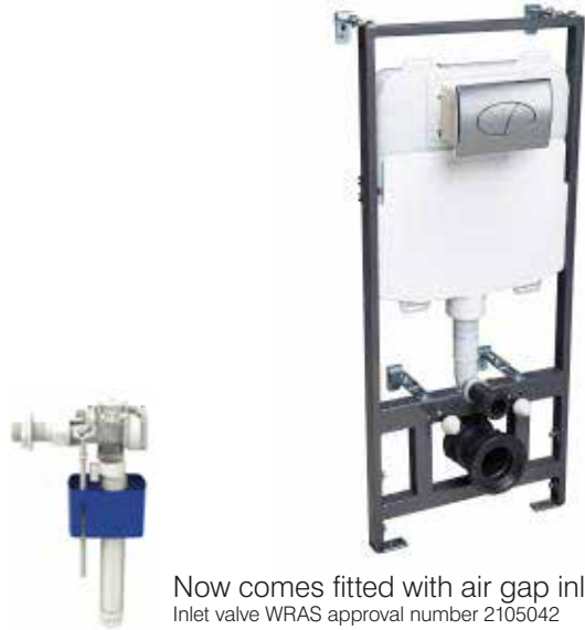
Now comes fitted with air gap inlet valve Inlet valve WRAS approval number 2105042