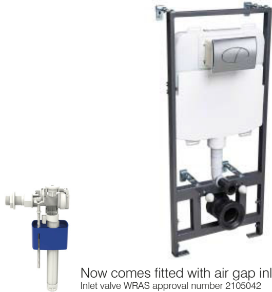
Now comes fitted with air gap inlet valve Inlet valve WRAS approval number 2105042